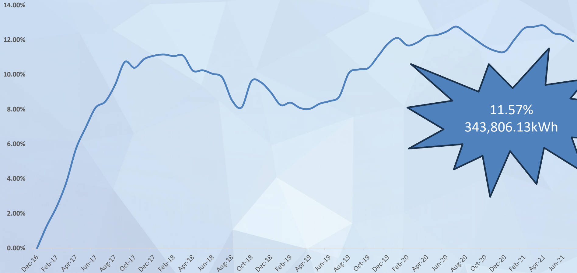
Annualized Savings (%) per year (inc. static factor)